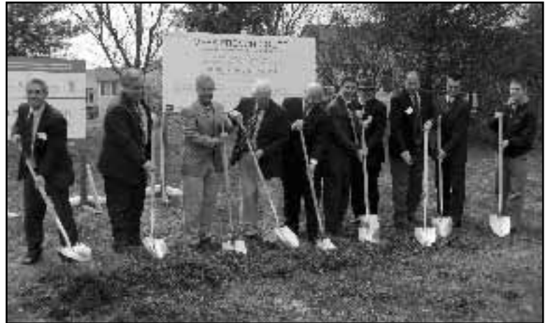
Ground Breaking of Vera French Court, Bettendorf, Iowa

The event launched construction of Vera French Court, providing rent-assisted housing for the most vulnerable members of our community.